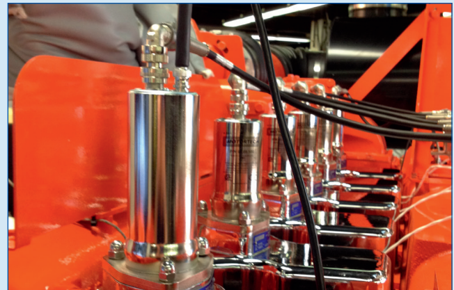
* MOTORTECH flange ignition coil with diagnostic interface